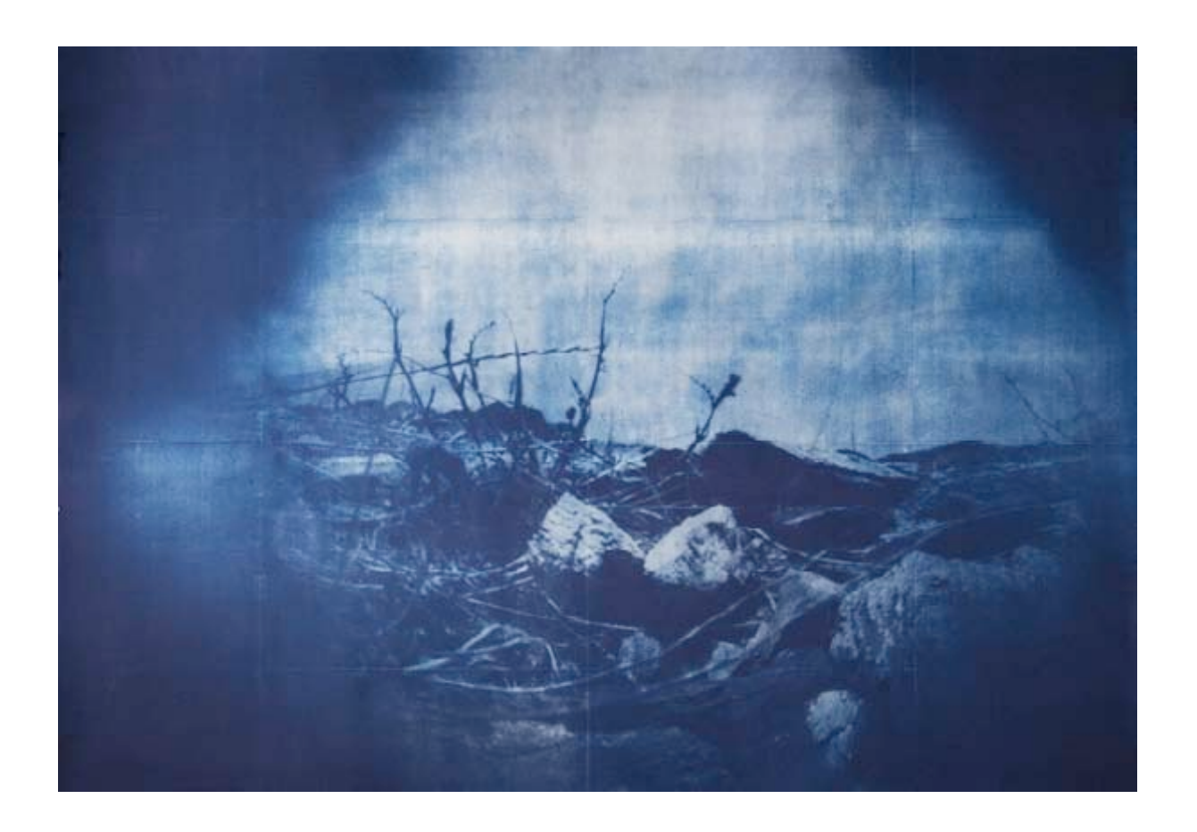
«Sans titre », cyanotype, 60 x 90 cm, 2013