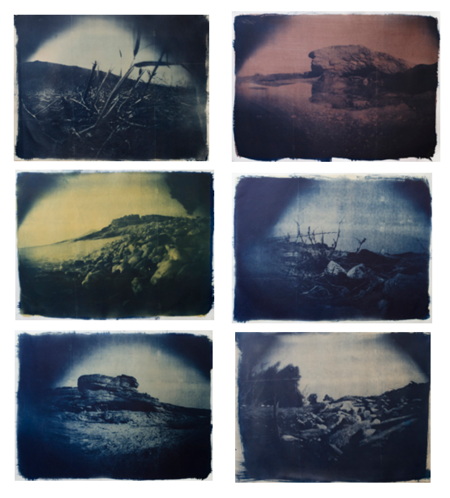
Living on a Mediterranean island year round for two years forces one to recognize the power and fearsomeness of nature: intense heat and drought, torrential rains and gale force winds. The radical changes to the climate over the course of the seasons force one to recognize the land itself as anything but stable. We wonder how the land, with its rocks, boulders and occasional plants clinging desperately to life, doesn't itself dry up and blow away. In the midst of the most intense heat the landscape transforms itself into a seeming vision of apocalpyse.